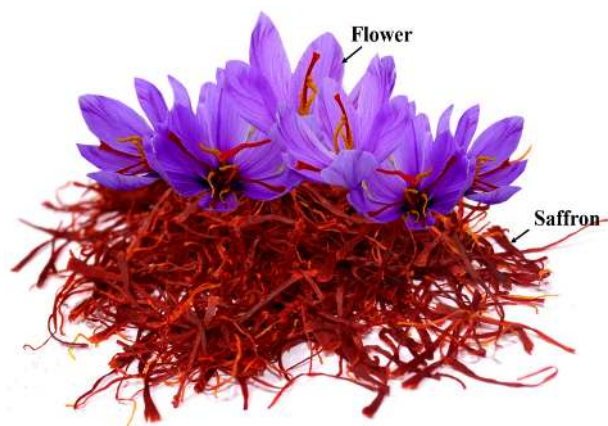
Figure 1. Illustration flower and stigmas of saffron ( Crocus sativus L. ).

Crocus sativus L. or saffron is known as Crocoideae – subfamily of Iridaceae family (i.e.: rich in endemic